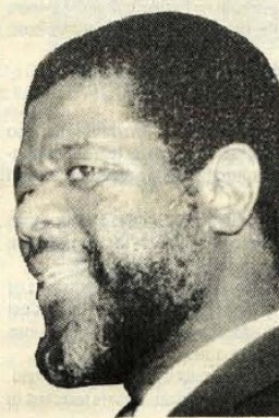
Mr Theo-Ben Gurirab

But there were others who were 'real traitors' he said, and they