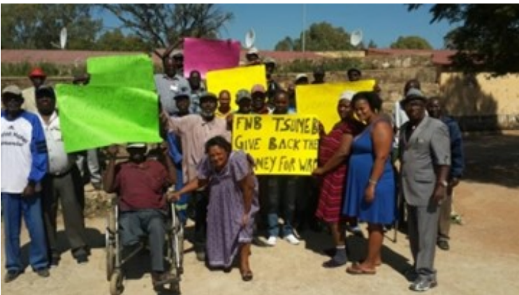
WRP in Tsumeb protests the FNB's illegal bank account in WRP's name