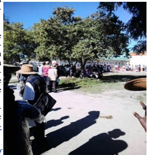
WRP members stopped by the police to march against the FNB in Eenhana on 27 April

On 20 and 21 May 2018, the WRP released open